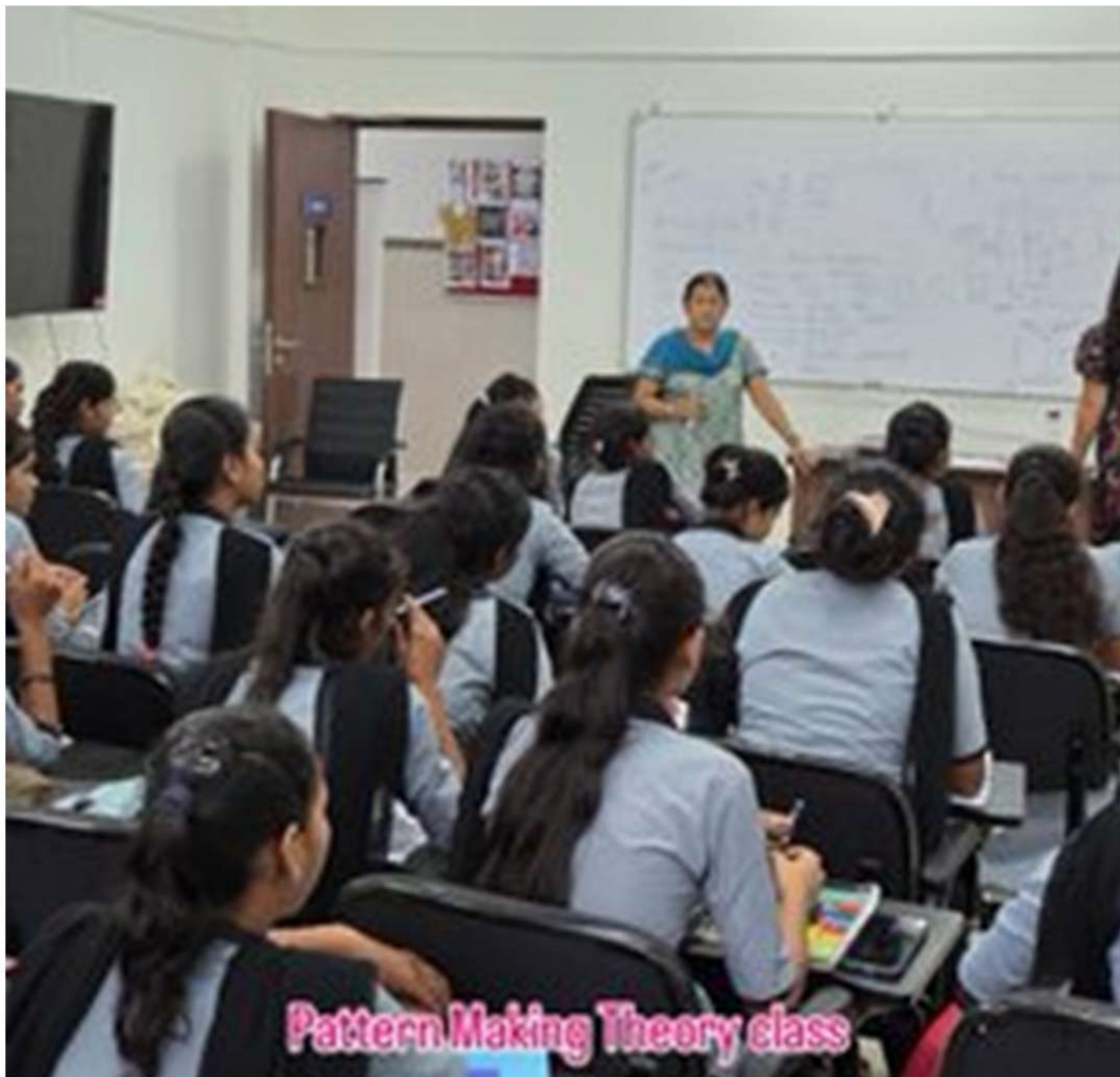
Pattern Making Theory class